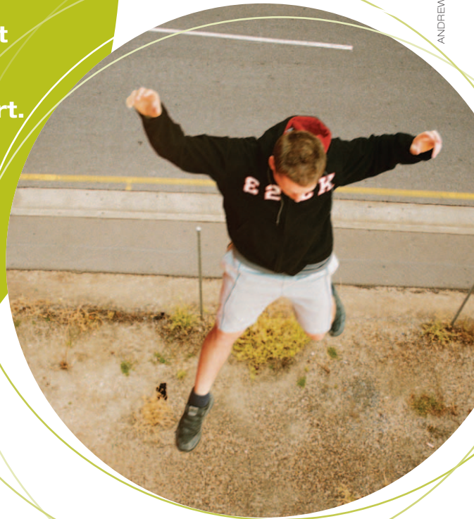
ANDREW BEST, FALL SERIES (KNOX) III, LIGHTJET PRINT, 2004

Touring throughout regional South Australia during 2007 and 2008.