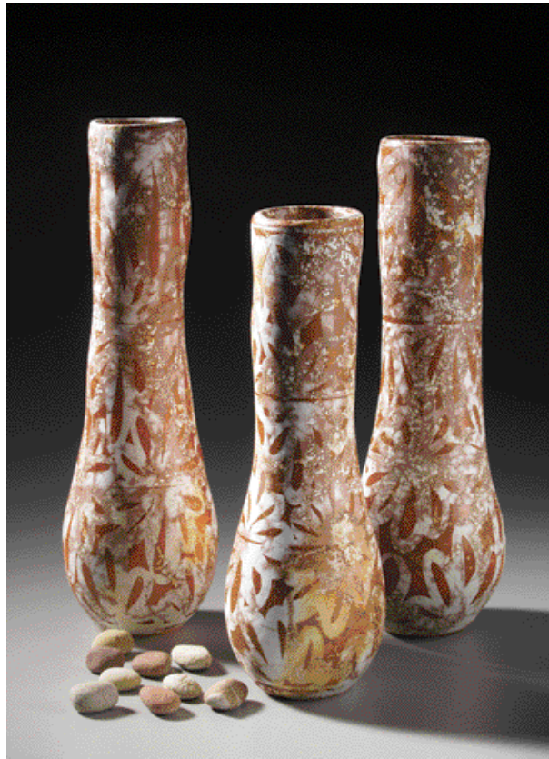
DANNY MURPHY, OUTBACK SERIES, 2008, TERRACOTTA, IHHH-SJILLALIA, SAGGAR-FIRED TO T1400C.

Dogs collect bones, kids collect dirt, but what do artists collect? Artists collect anything and everything from the unfathomably obscure to the blindingly obvious.